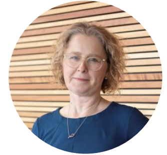
Kenya Stump Kentucky SEO